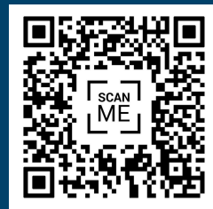
Parenting Wayward Children