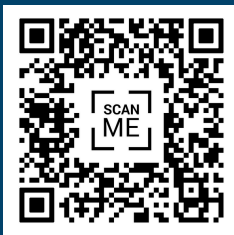
Who Is Jesus?

Nineteen different classes were offered this year with an average weekly attendance of 238. The classes were aimed at exploring various aspects of faith, personal growth, and Christian living. Topics ranged from practical guidance to deep theological discussions, catering to a wide array of interests and life stages.