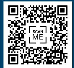
Pop Psychology vs. Jesus